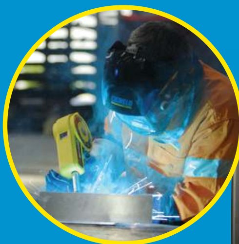
Optional SGT250 Spool Gun ideal for your precision aluminium fabrication, repairs and auto/marine work.