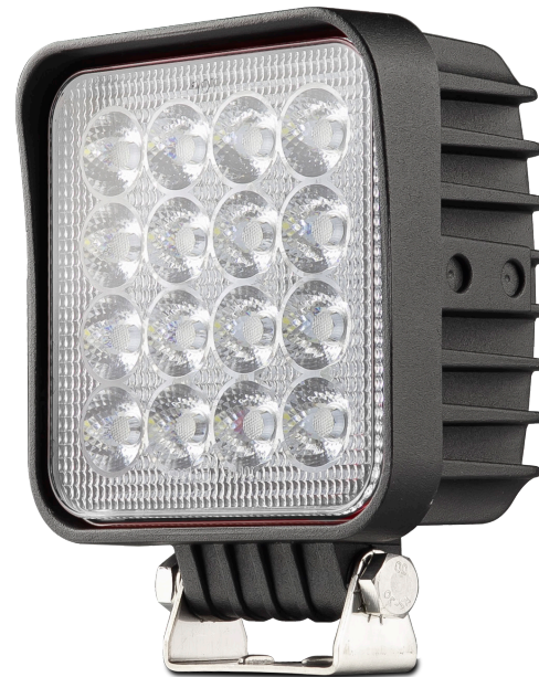
Part No. FL48W - Box