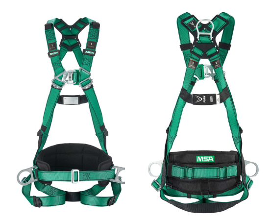
V-FORM, Steel Hardware, Back & Chest & Hip D-Ring, Shoulder Loop, Qwik-Fit buckles (P/N 10205385/10205386/10205387)

V-FORM, Steel Hardware, Back & Chest D-Ring, Shoulder Loop, Qwik-Fit buckles (P/N 10205379/10205380/10205381)