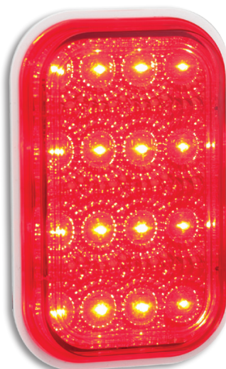
Stop/Tail 131RM - Single Blister

Approvals Function Category CRN ADR Stop/Tail 49/00 46431 ADR Indicator 6/00 Cat2a 46430 ADR Reverse 1/00 46432