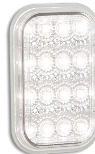
Reverse 131WM - Single Blister