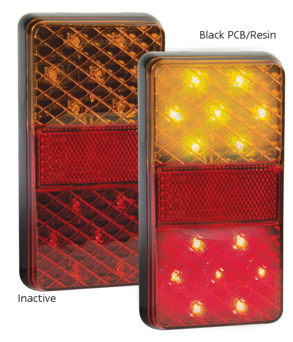
Stop/Tail/Indicator/Reflector 150BARB - Bulk Boxed, 12 Volt