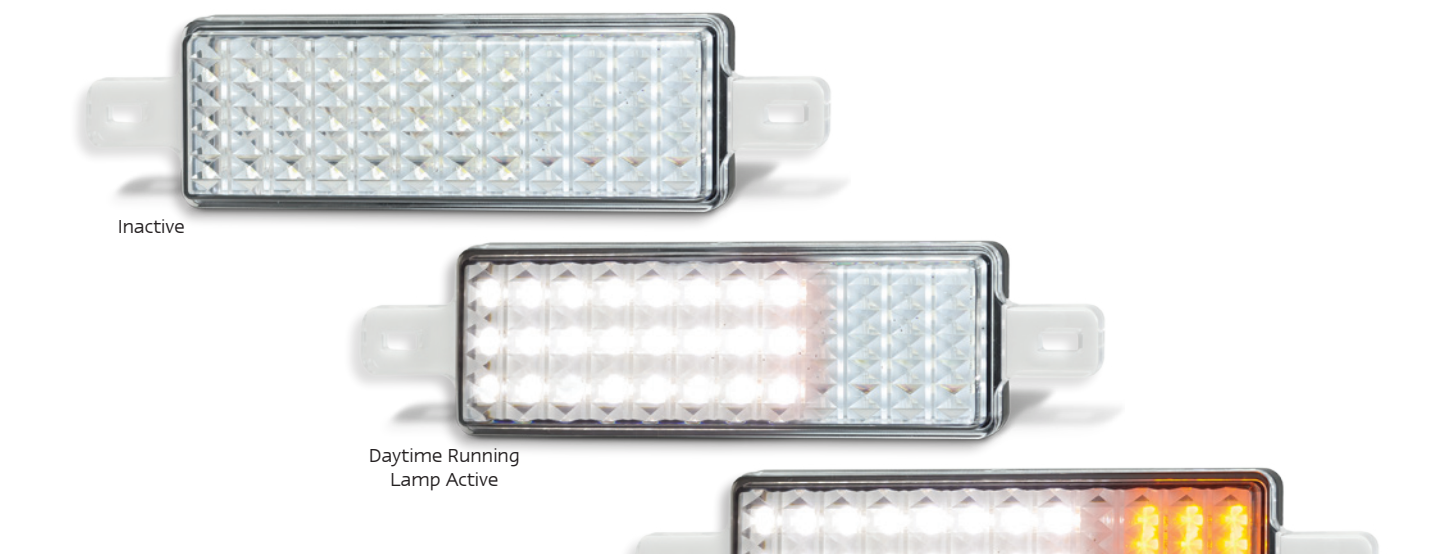
Front Indicator and Daytime running Lamp Active