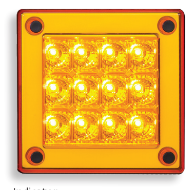
Indicator 280AM - Single Blister