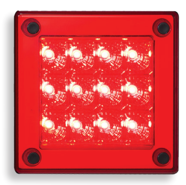
Stop/Tail 280RM - Single Blister