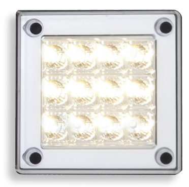
Reverse 280WM - Single Blister