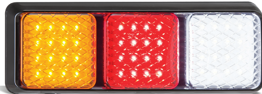
Stop/Tail/Indicator/Reverse 282ARWM - Blister, 12-24 Volt 282ARWMB - Box, 12-24 Volt