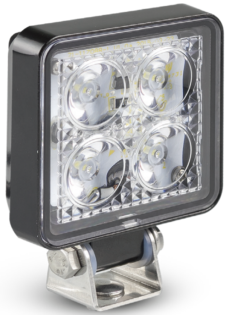
Reverse/Flood Lamp, Black E-Coated 7312BM - Blister