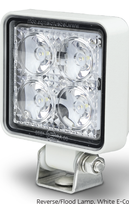
Reverse/Flood Lamp, White E-Coated 7312WM - Blister