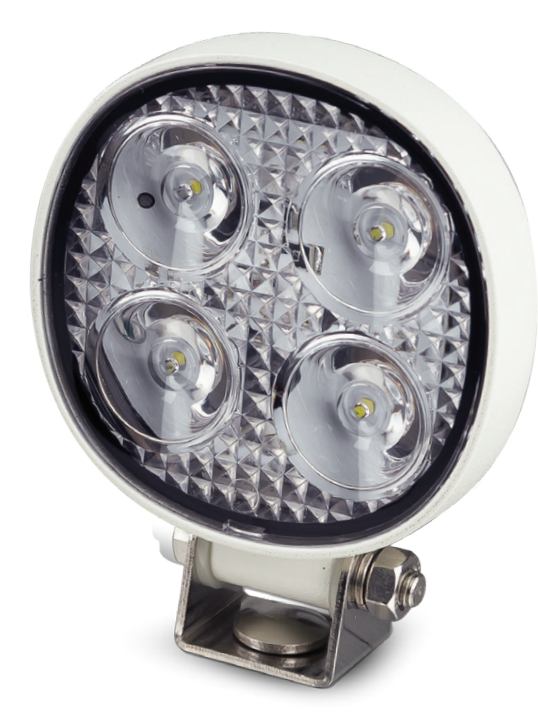
Reverse/Flood Lamp, White E-Coated 7512WM - Blister