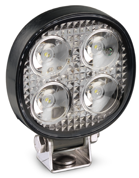
Reverse/Flood Lamp, Black E-Coated