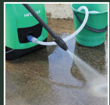
Step 6: Switch the washer off and connect the spray nozzle, switch the washer back on & pull the trigger to commence washing