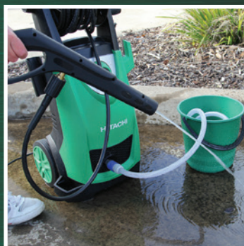
Step 5: Switch the washer to the on position & pull the trigger until sufficient water is flowing out