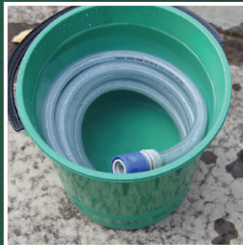
Step 2: Sink the entire 3 metre length of garden hose into a bucket filled with water