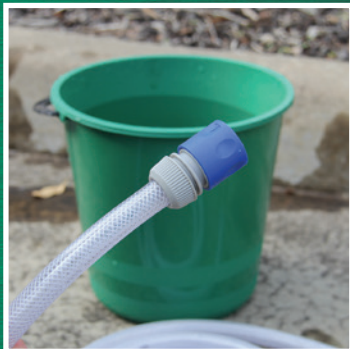
Step 1: Attach the One-Touch Hose Joint to one end of a 3 metre length of garden hose

** One-Touch Hose Joint only supplied with AW130 & AW150 models