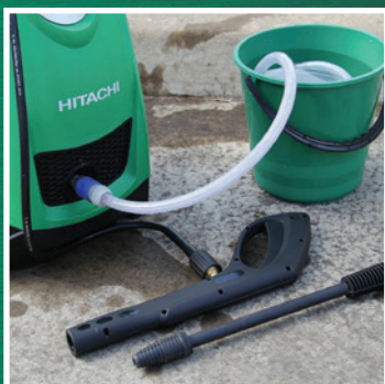
Step 4: Connect the washer to the power supply & switch on without the spray nozzle attached