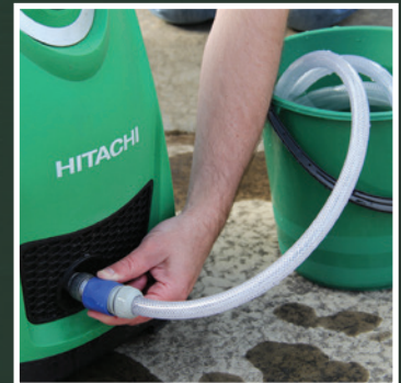
Step 3: Connect the One-Touch Hose Joint to the water feed connector on the washer