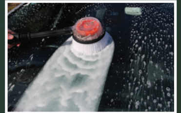
Images show brushes used with AW150