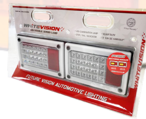
RETAIL READY PACKAGING