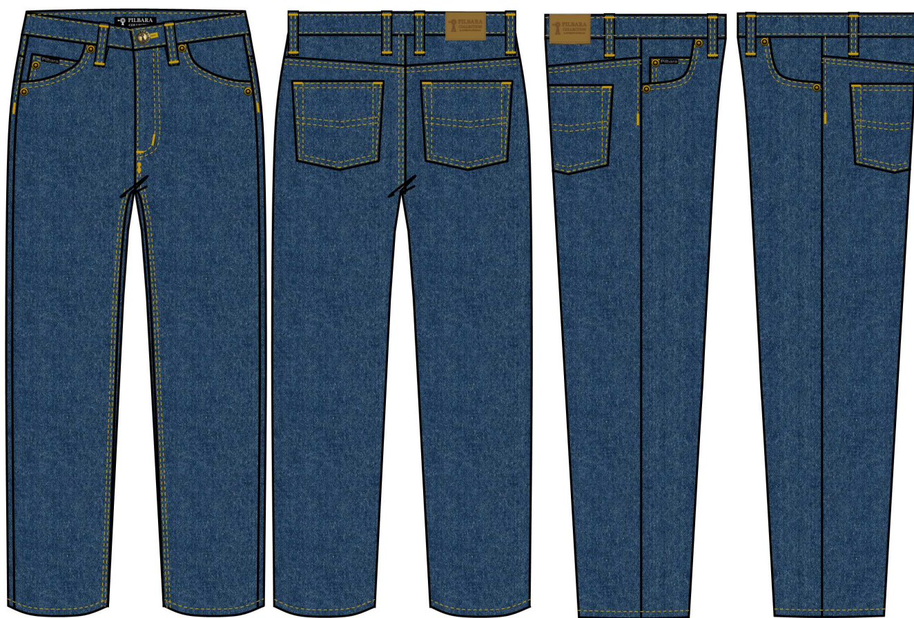
Stone Wash Denim Blue