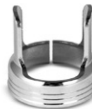
STANDOFF GUIDE SKU: WGSC2540