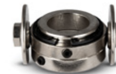
CUTTING BUGGY SKU: WGSC2551

The UNIMIG Standoff Guides keep distance between your plasma torch and the workpiece, extending consumable life.