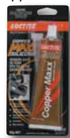
Loctite® 5920 Copper Maxx®

Single component RTV non-sag silicone paste for low volatility applications. Adheres to metal, glass, natural and synthetic fibres, wood, ceramics, and many plastic substrates. Oxygen sensor safe.