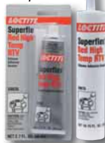
Loctite® 596 Superflex Red

Recommended for sealing all of flanges including stamped sheet metal where high temperature resistance is required, e.g. assembly and repair of industrial furnaces, ovens, boilers, exhaust stacks and high temperature ducting.