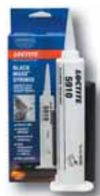
Loctite® 5910/598 Black Maxx®

Replacement for cork and paper cut gaskets on flanges and stamped sheet metal covers. Recommended for use where high vibration or flexing occurs. Can also be used with plastic parts. Oxygen sensor safe.