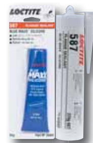
Loctite® 587 Blue Maxx®

Recommended for sealing all types of flanges including stamped sheet metal where high flexibility and high oil or water glycol resistance is required. Oxygen sensor safe.