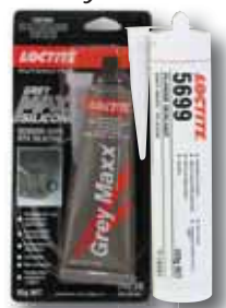
Loctite® 5699 Grey Maxx®

Designed for high torque applications. Remains flexible and withstands high vibration. Outstanding oil and shop fluid resistance. Non-corrosive, low odour.