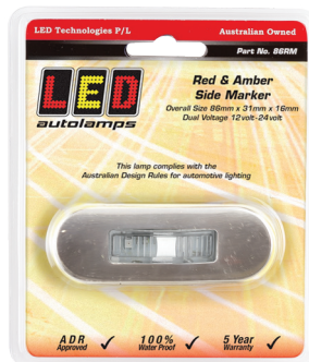
Part No. 86ARM